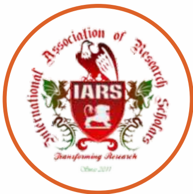
International Association of Research Scholars ( www.IARS.info ) Victoria, Australia