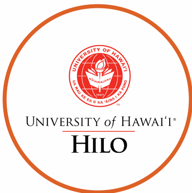
University of Hawai'i Hilo, USA